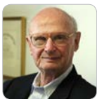
Harry M. Markowitz, PhD Nobel Prize-Winning Economist Founder of Modern Portfolio Theory