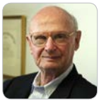
Harry M. Markowitz, PhD Nobel Prize-Winning Economist Founder of Modern Portfolio Theory